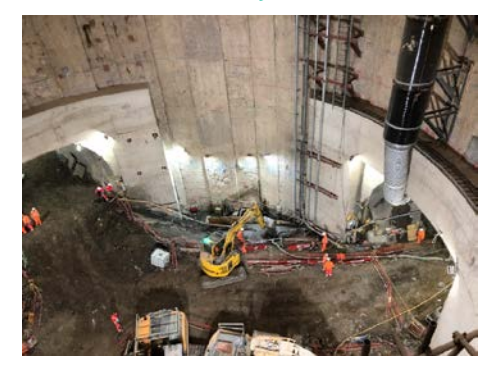
Kirtling Street Horizontal Excavation