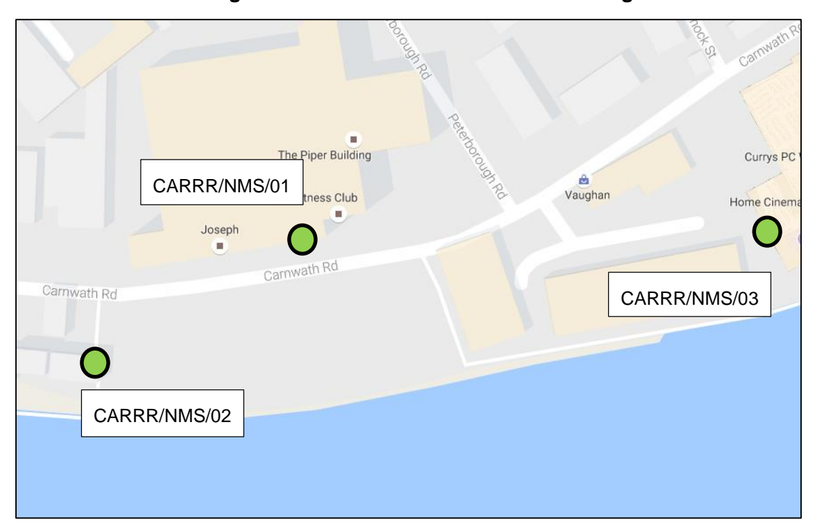
Figure 2.1 Carnwath Road Noise Monitoring Locations