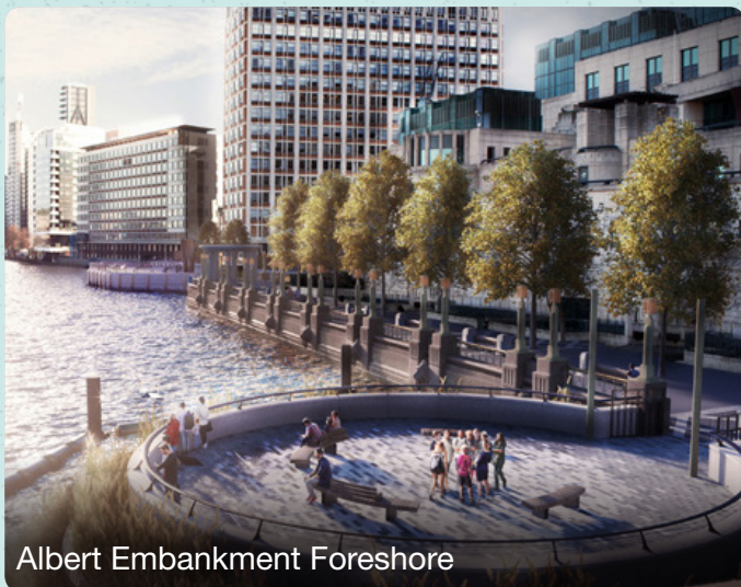
Albert Embankment Foreshore