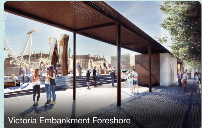
Victoria Embankment Foreshore