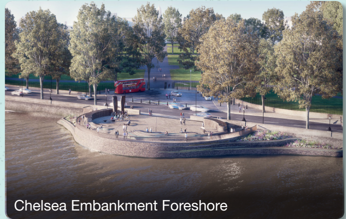
Chelsea Embankment Foreshore

"In keeping with Bazalgette's legacy, the new public spaces will be designed to enhance the environment and provide a lasting legacy. Our ambition is to celebrate the River Thames as the heart of London."