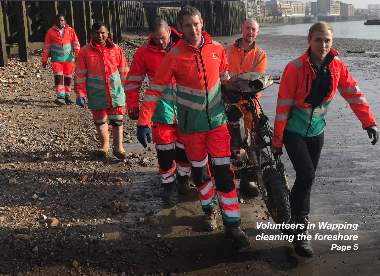
Volunteers in Wapping cleaning the foreshore Page 5