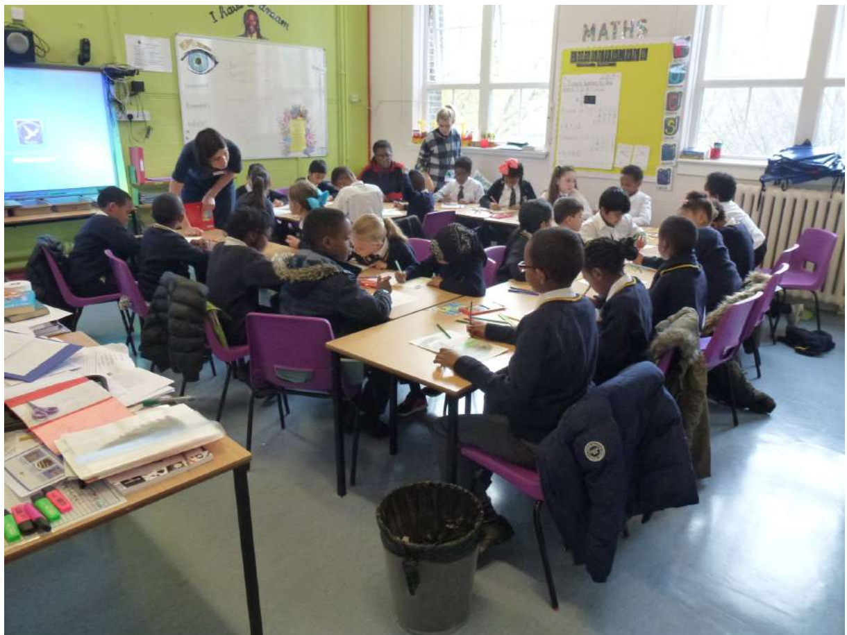
Workshop session.

Elinor engaged with a group of 25 pupils from across the year groups during the project and introduced to them a wide range of drawing, painting and sculpting techniques.