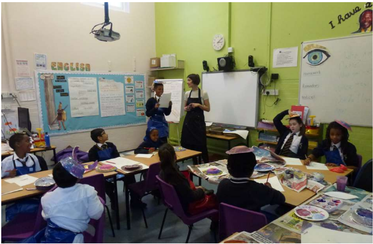
Creating hats.

During the fourth workshop on 23 November the group looked at the multicultural history of the River Thames. A presentation began with Neolithic human remains, which had been found alongside the Thames and then moved on to the Roman invasion and the birth of Londinium, near present day London Bridge. They looked at the The Wendles (legendary Vikings that feature in the Wandsworth crest) and discussed trading since medieval times, particularly between the 17<sup>th</sup> and 19th century when boats from all over world brought different goods, trades and people. The group also looked at the Huguenots as refugees that fled France from religious persecution to settle in Wandsworth. They were cloth makers as well as hat makers. Following on from Alex's discussion about how Victorian hats denoted a person's role, and a look at Roman and Viking helmets and the hats of the Huguenots everyone made their our own hat. The children worked with paper plates, silver bowls, paper, glue and paint to make the hats, some were based on historical ones seen in the presentation, others from imagination. This was followed by group work to design a boat, carrying goods and with figure heads, which resulted in some excellent drawings. The pupils gave presentations, each playing the part of a sailor, and telling the class where they had come from and what goods they had onboard.