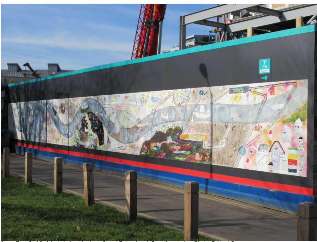
Inner Eye, Child's I installed on the hoarding at Falconbrook Pumping station.