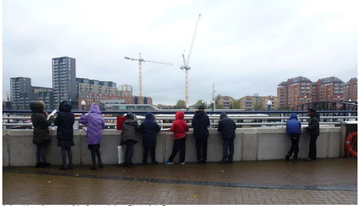
A riverside walk as part of the first workshop.

Workshops took place between 7 November and 7 December 2017. The first workshop on 7 November 2017 involved a trip to the Falconbrook Pumping Station, the River Thames and to the site where the River Wandle meets the River Thames. The walk proved to be an important way of connecting these locations on foot as many children, although all locally based, have never been to the river and were not aware how close they lived to it. During the walk the pupils made drawings of the Pumping Station as well as both rivers.