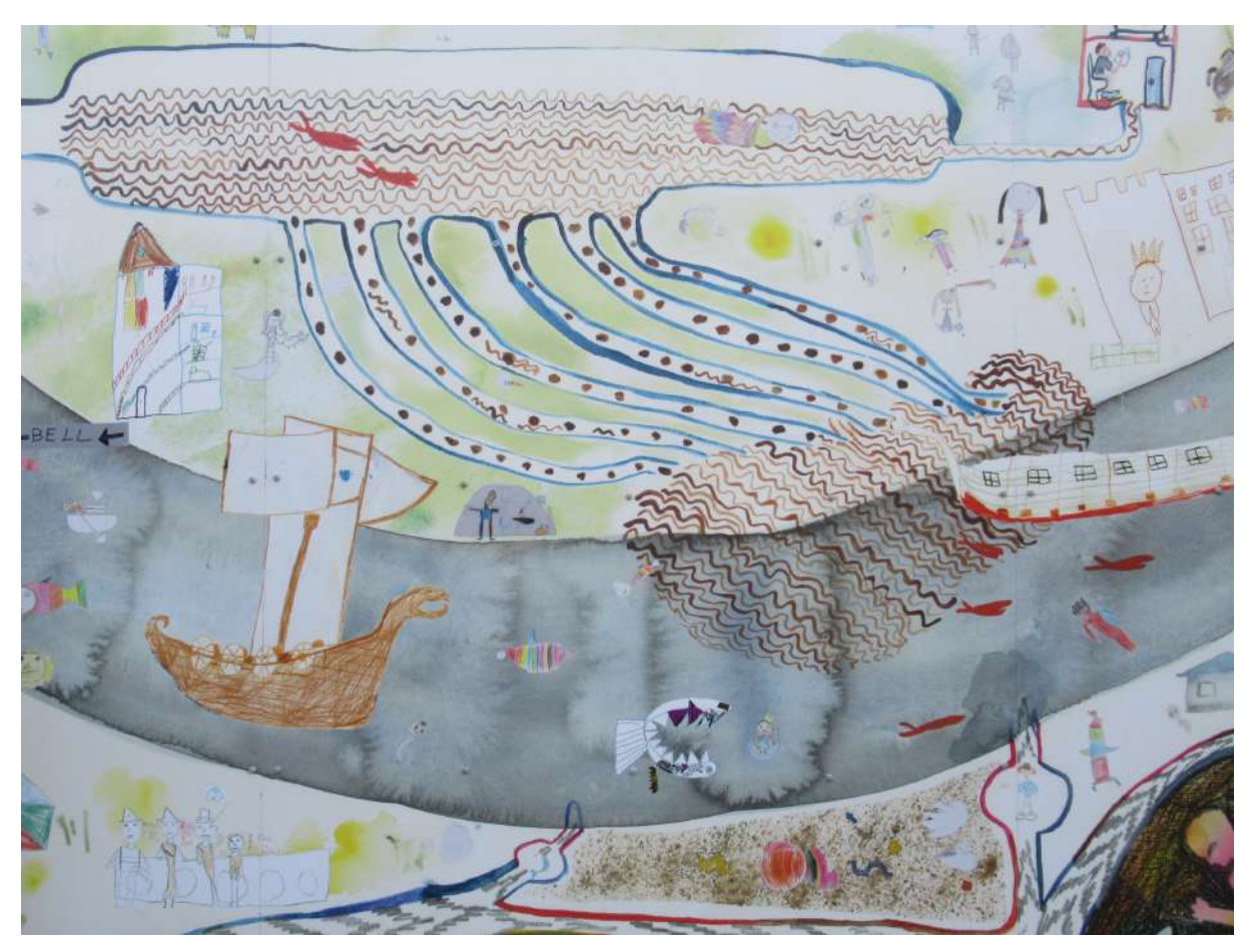
Detail of Inner Eye, Child's I installed on the hoarding at Falconbrook Pumping station.

Elinor greatly enjoyed working collaborating with the pupils at Falconbrook Primary School: