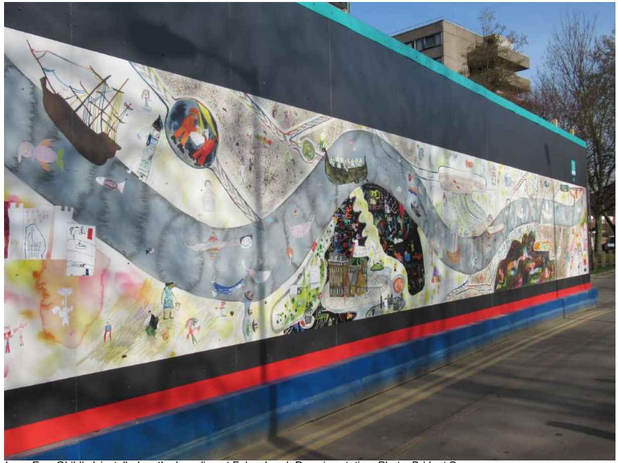
Inner Eye, Child's I installed on the hoarding at Falconbrook Pumping station.

Interesting. Eye-catching. Historical. It makes me stop and reflect.