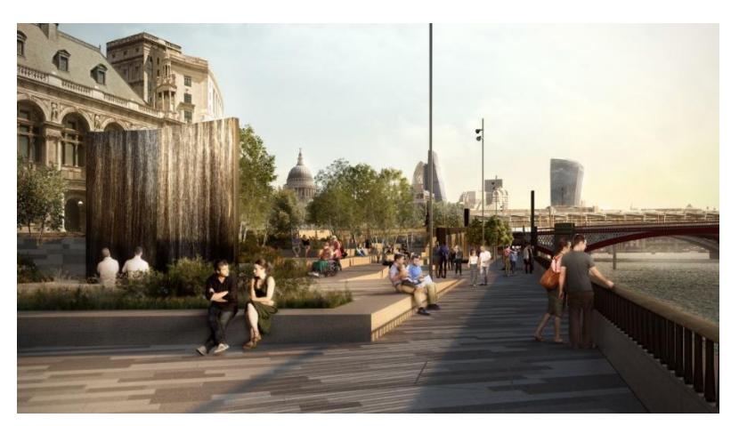
Indicative image of the Bazalgette Embankment

If you have any questions about this work, or require further information, please contact the Tideway Helpdesk on 08000 308080 or <u>helpdesk@tideway.london.</u>