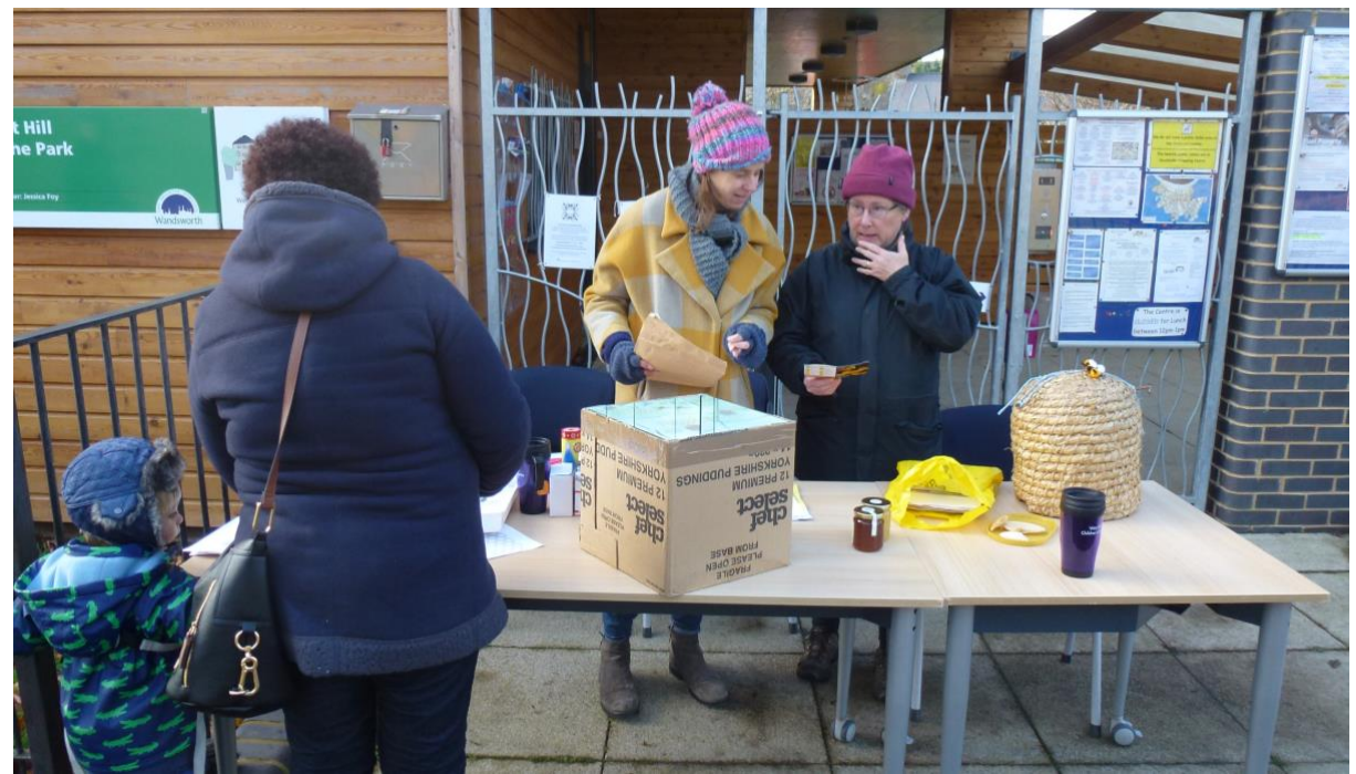
Workshop session activities

The third workshop on 27 November took place at the Children's Centre and Emily continued working with the families on the development of more complex collages using a range of techniques: cutting, painting, drawing, mark making, printing. The artists created three stations, each with different focus and ensured that the session was free-flowing, creative and open. 16 adults and 18 children attended this session and work produced features on the design.