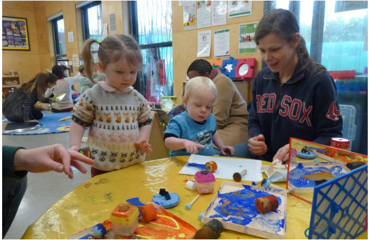
Workshop session activities

The third workshop on 27 November took place at the Children's Centre and Emily continued working with the families on the development of more complex collages using a range of techniques: cutting, painting, drawing, mark making, printing. The artists created three stations, each with different focus and ensured that the session was free-flowing, creative and open. 16 adults and 18 children attended this session and work produced features on the design.