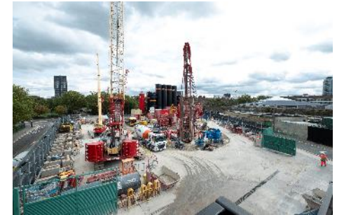
Deptford Church Street

The design and manufacture of the two east TBMs, Selina and Annie, is currently under way in Germany and they are due for delivery in early 2020.