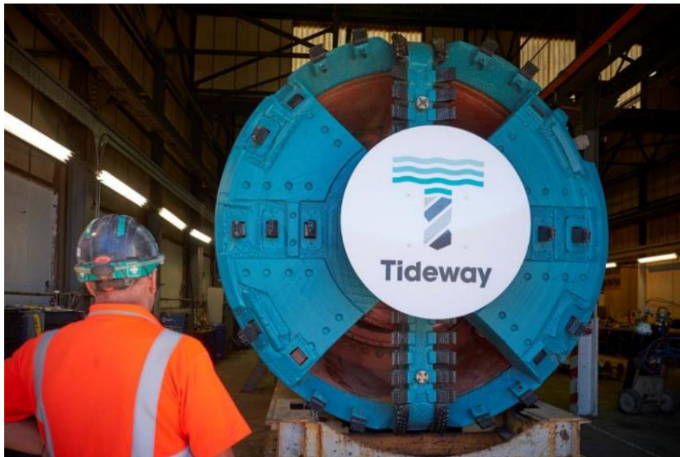
TBM Charlotte undergoing tests at Morgan Sindall, Staffordshire