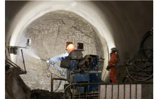
Hammersmith Pumping Station