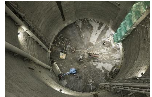
Carnwath Road Riverside