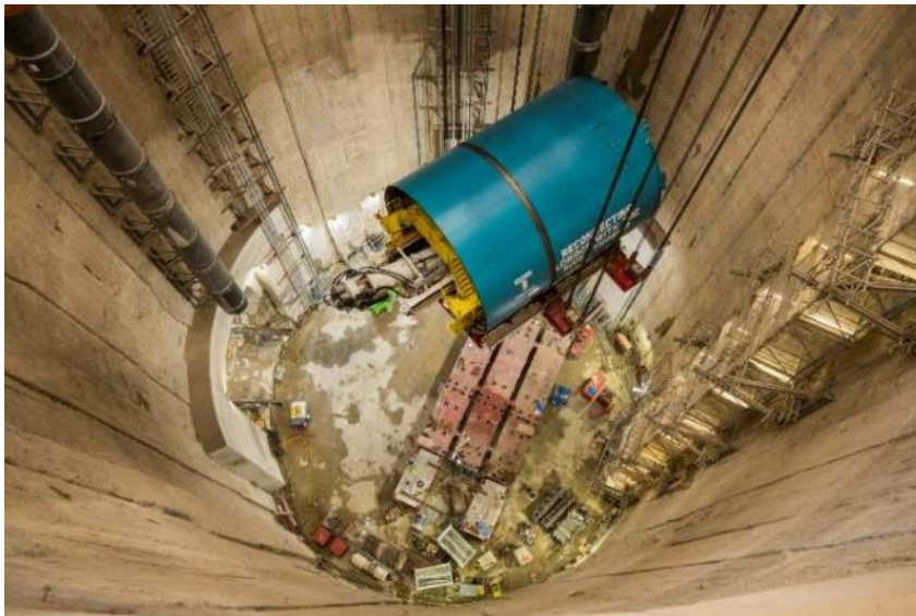
Lowering of TBM Millicent at Kirtling Street