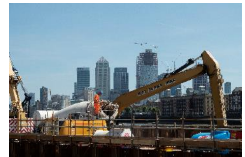
King Edward Memorial