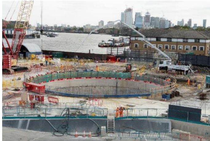
Chambers Wharf progress

The design and manufacture of the two east TBMs, Selina and Annie, is currently under way in Germany and they are due for delivery in early 2020.