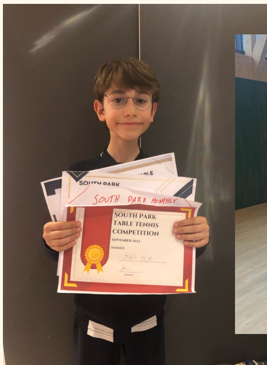
Table tennis training and tournaments