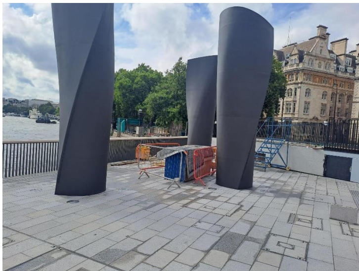
Vent columns at the western end of the site.