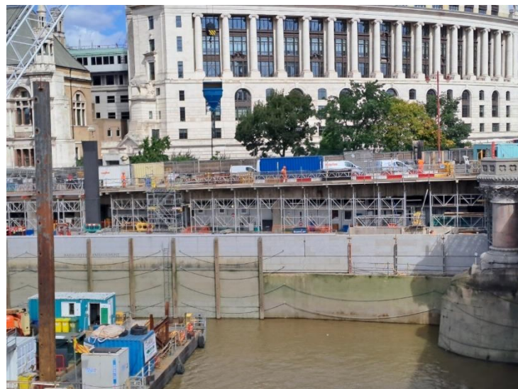
View of the new river wall from Blackfriars Bridge.